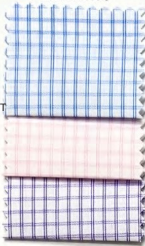
STERLING TWILL 70's