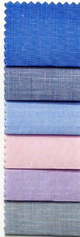
ROYAL OXFORD 80's